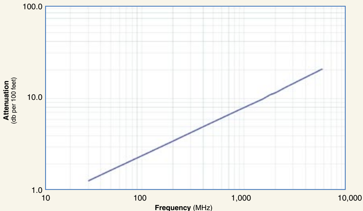
Attenuation vs. Frequency (typical)